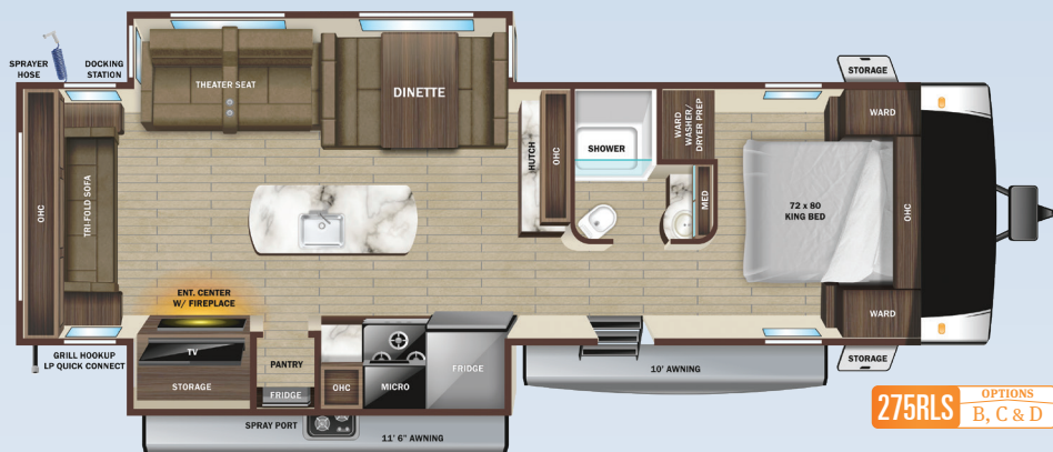
275RLS OPTIONS B, C & D