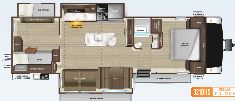
321BHS OPTIONS B, C, D & E