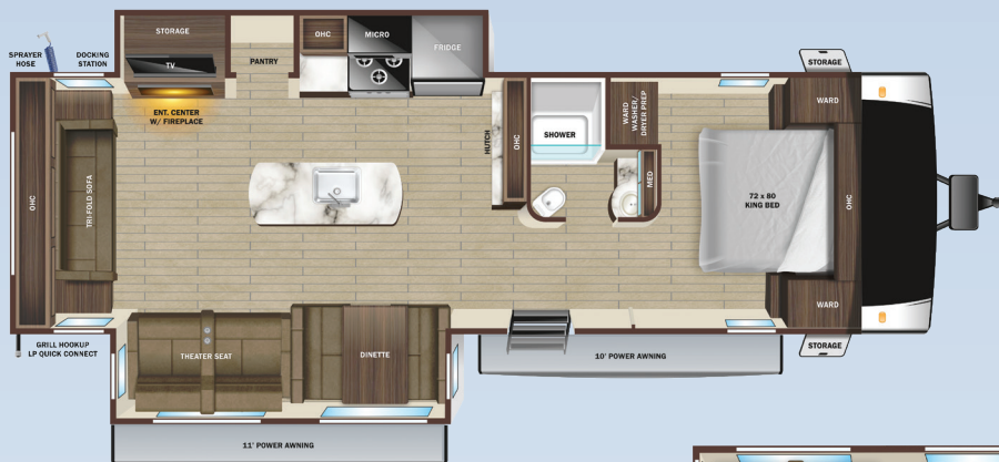
290RLS OPTIONS A, C & D