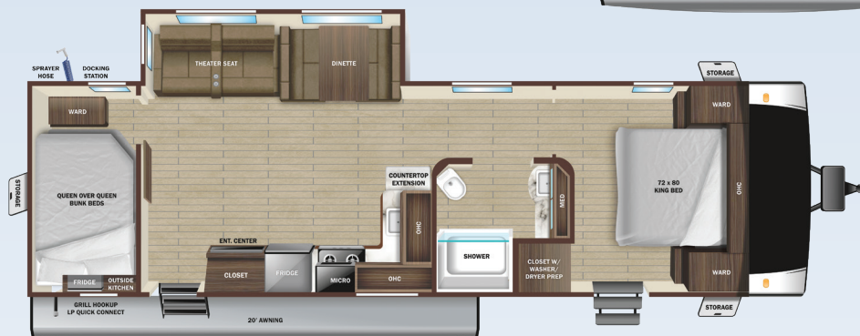
296BHS OPTIONS B, C, D & E