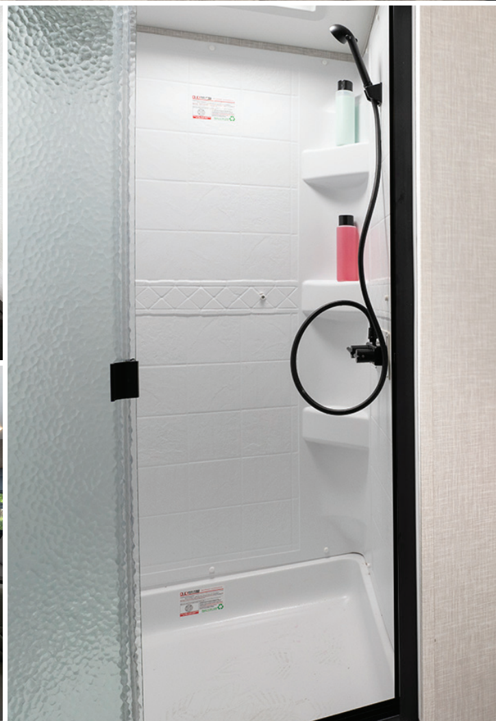
2023 Light 275RLS